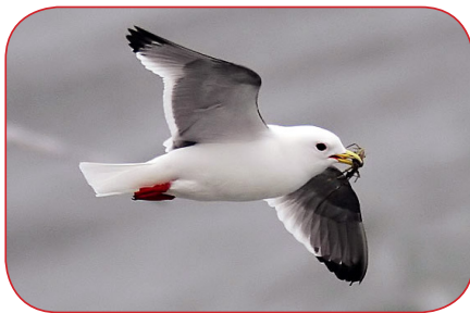
Red-legged Kittiwake: Glen Tepke

Oak Titmouse California Gnatcatcher ( Threatened ) Wood Thrush Varied Thrush Wrentit California Thrasher Leconte's Thrasher Sprague's Pipit Blue-winged Warbler Virginia's Warbler Colima Warbler Lucy's Warbler Bay-breasted Warbler Hermit Warbler Grace's Warbler Prairie Warbler Cerulean Warbler Prothonotary Warbler Swainson's Warbler Kentucky Warbler Canada Warbler Red-faced Warbler Abert's Towhee Rufous-winged Sparrow Five-striped Sparrow Brewer's Sparrow Sage Sparrow Lark Bunting Le Conte's Sparrow Nelson's Sharp-tailed Sparrow Smith's Longspur Chestnut-collared Longspur McKay's Bunting Varied Bunting Painted Bunting Rusty Blackbird Audubon's Oriole Black Rosy-Finch Brown-capped Rosy-Finch Lawrence's Goldfinch