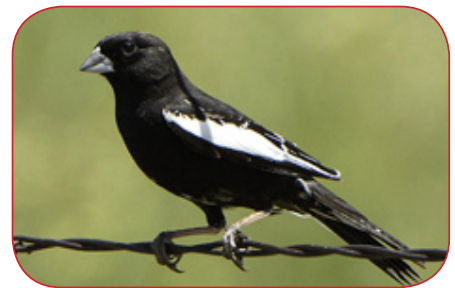
Lark Bunting