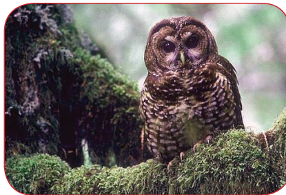
Spotted Owl