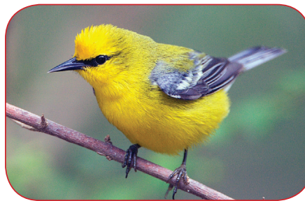
Blue-winged Warbler: Peter LaTourrette